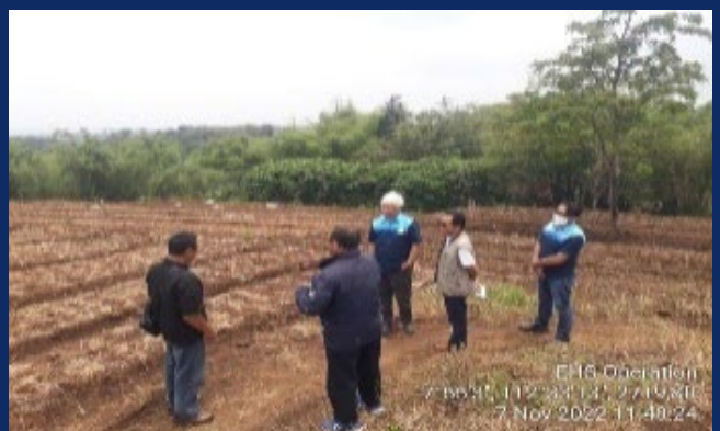
Site Survey With NGO Baskomas and University UIN location for tree planting dan nursery program