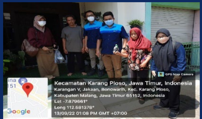
Discussion and site visit to PAMSIMAS related water quality and water quantity management in catchment area