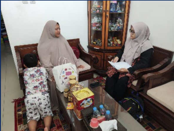
Discussion with Mrs. Lucky (who responsible in BBWS Brantas Basin), communication related water infrastructure

We doing stakeholder engagement that can help us in the AWS implementation.