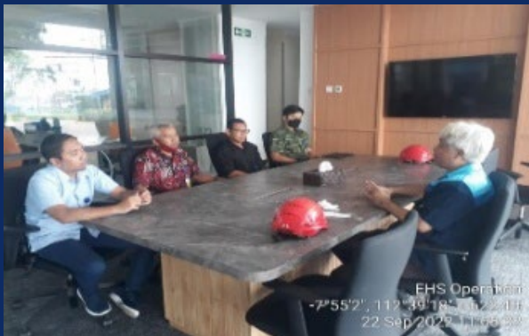
We do a engage NGO Baskomas related tree planting and nursery at the Up Stream