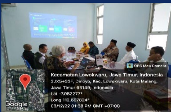
Discussion and consultation with University UIN Malang related maintenance of water quantity and tree planting plan dan nursery di Up Stream