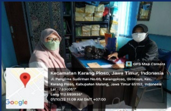
We have consulted with the Health Center at Karangploso District of Malang to find out about water quality.